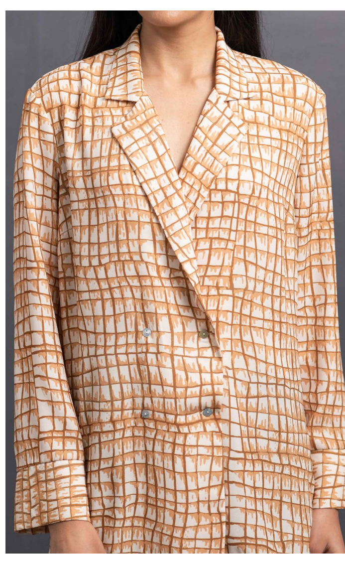
Printed jacket with belt Composition - 100% Recycled polyester Original print design concept