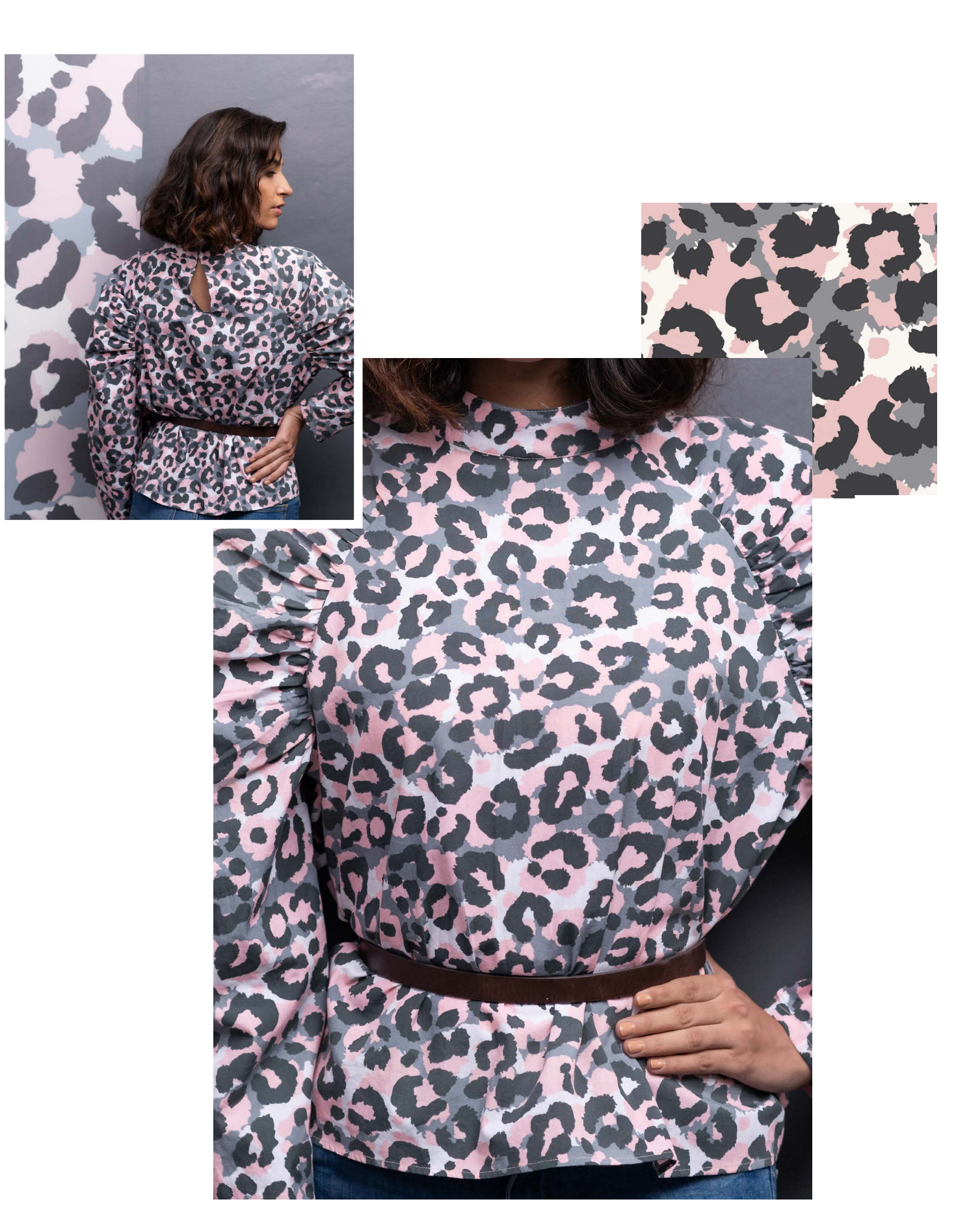
Leopard print raglan sleeve blouse Composition - 100% Organic cotton Original print concept