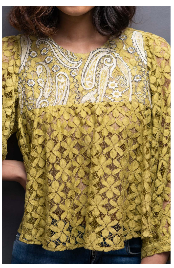
Embroidered lace blouse Composition - Cotton nylon blend In house embroidery concept