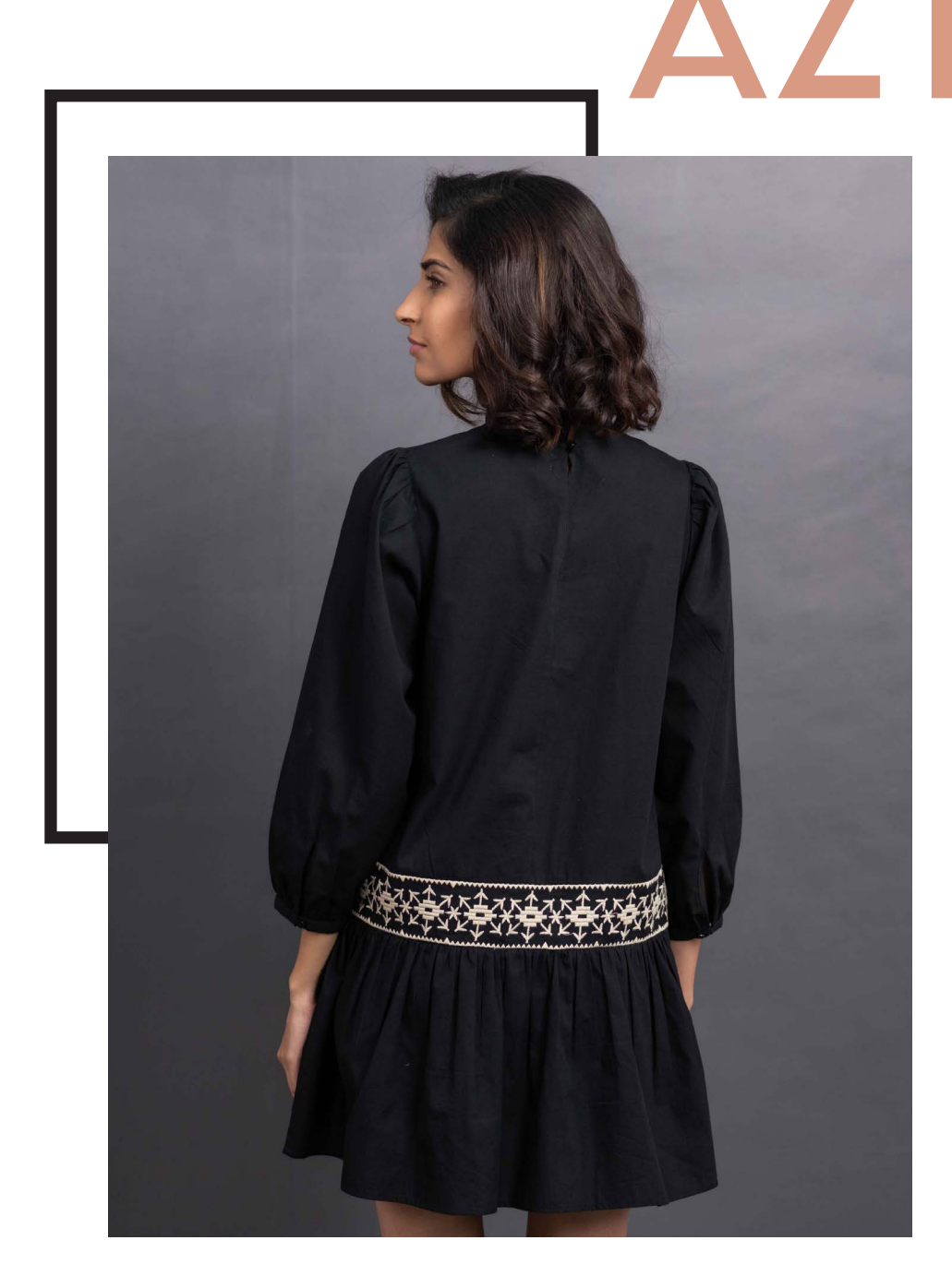
Embroidered short dress Composition - 100% Organic Cotton In house embroidery concept