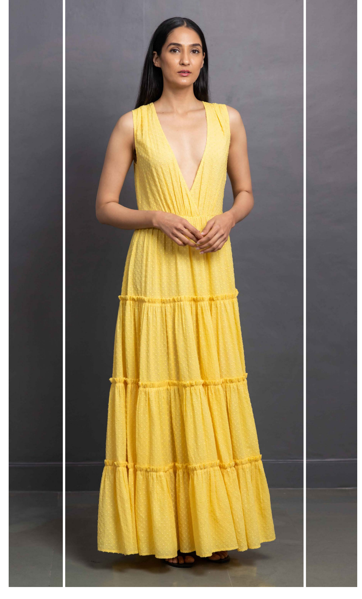
Surplice neckline maxi dress Composition - 100% Organic Cotton Dobby dot