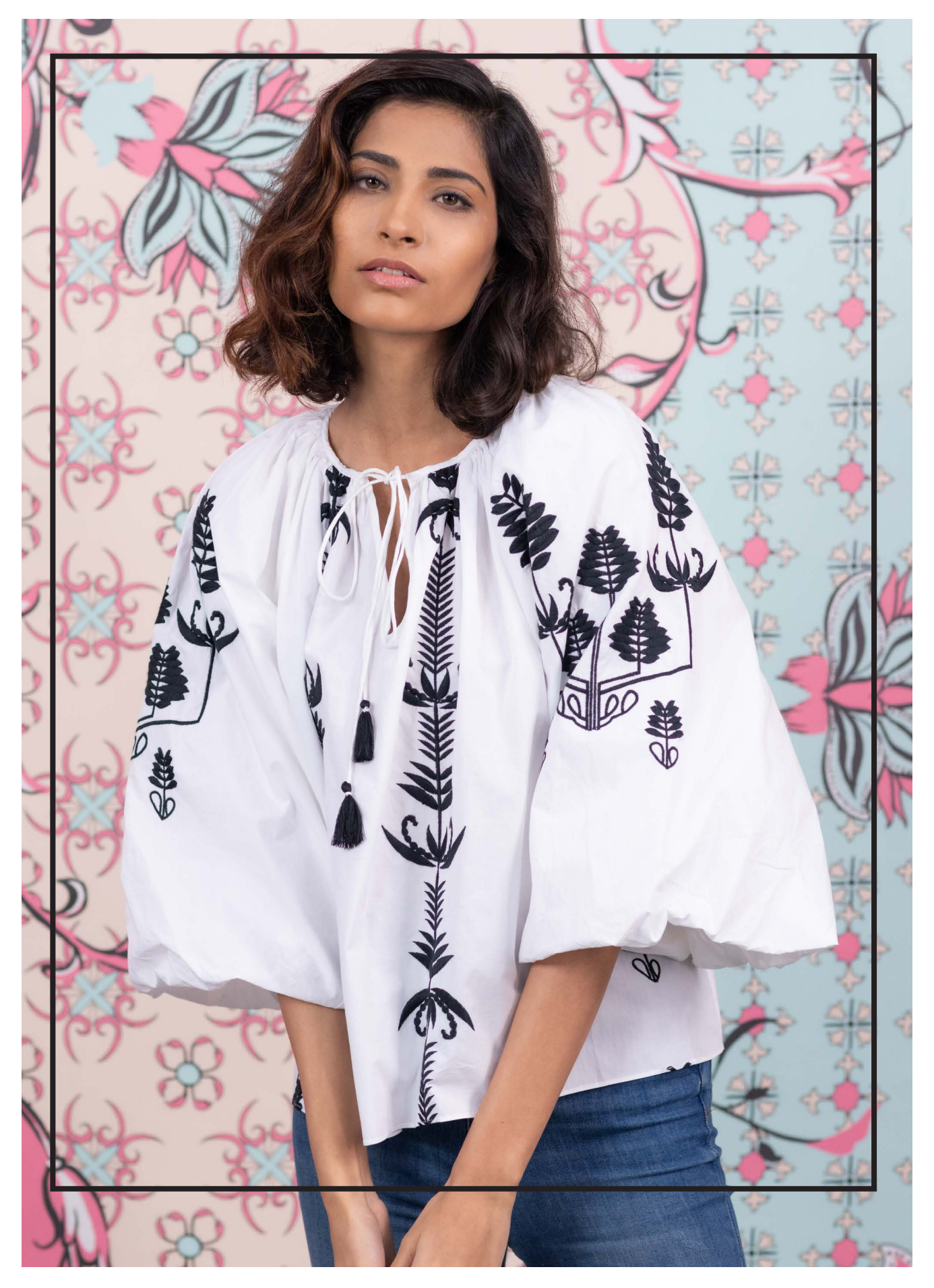
Embroidered peasant blouse with neck tie detail and volume sleeve Composition - 100% organic cotton poplin In house embroidery concept