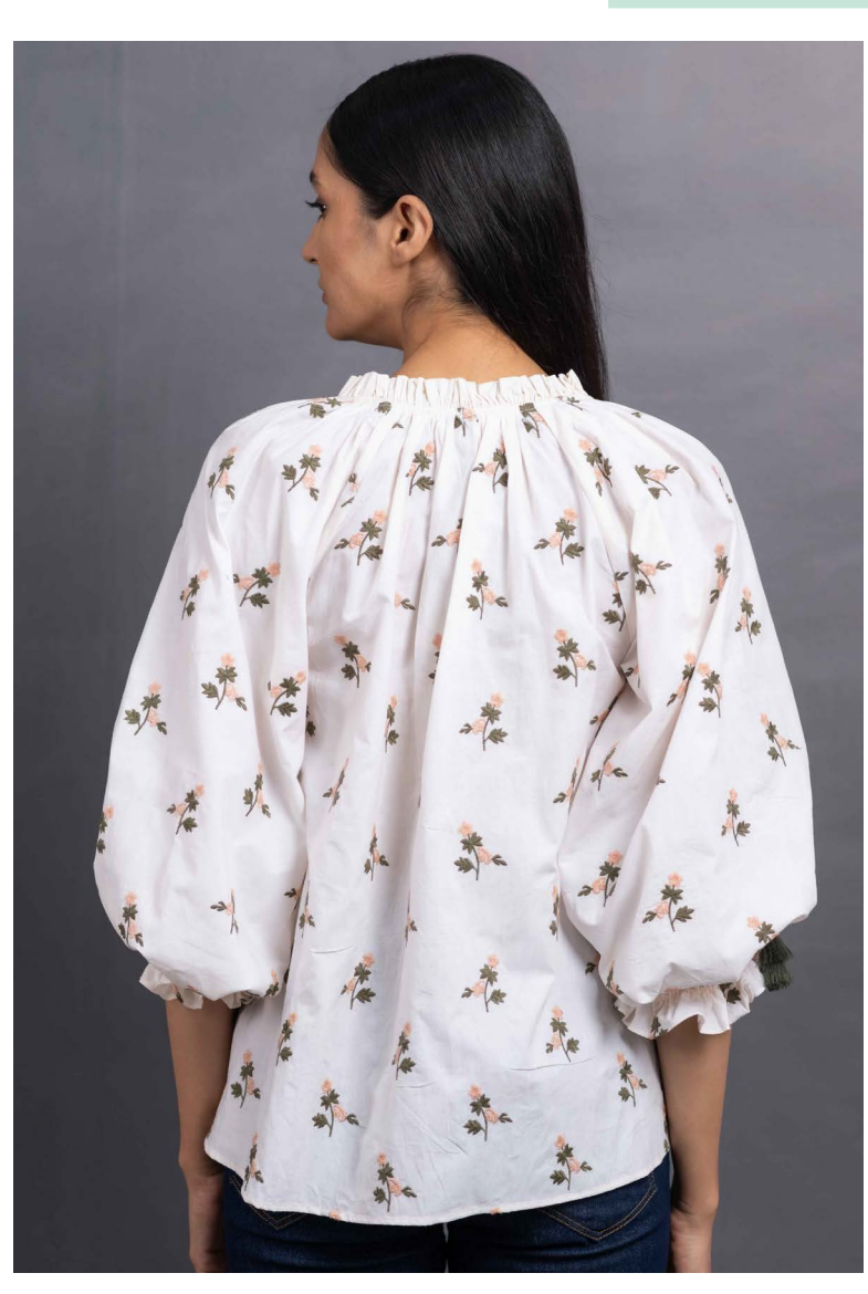
Floral embroidered peasant blouse with string details Composition - 100% organic cotton poplin In house embroidery concept